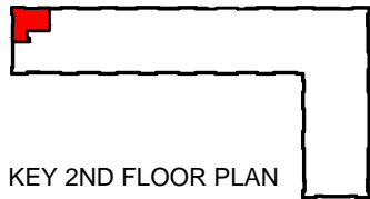
KEY 2ND FLOOR PLAN